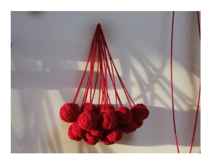
Repair, 2017, (detail of installation), salvaged piano strings, & Red thread